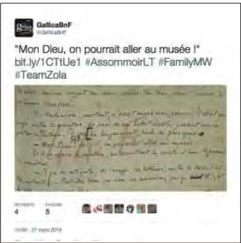
illustration 6), or with images, photographs, and press drawings found in the French National Library's digitised collections.

The fact is that the #AssommoirLT operation got completely lost in the hyperactive flow of the #MuseumWeek, and hardly anybody noticed Gervaise and Coupeau's misadventures. Only one tweet (cf. illustration 7), showing a photograph of the Louvre, got retweeted many times, but it was probably because the picture was compelling to the many people who had been to the museum and were suddenly given the opportunity to see how it looked more than a century ago. It did not