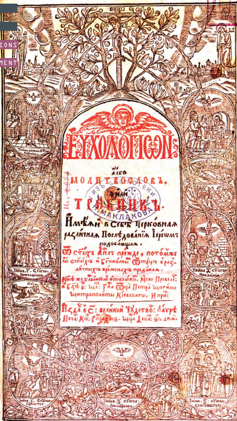
Petr Mohyla's Breviary (1646)