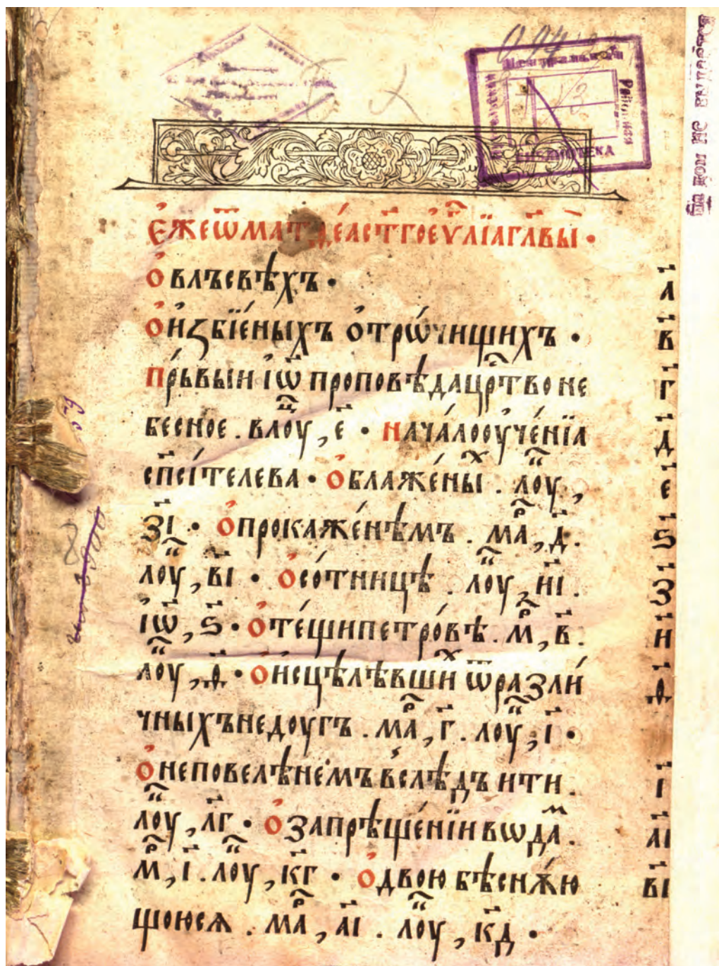
The altar gospel, published by Petr Mstislavets in Vilnius (1575)