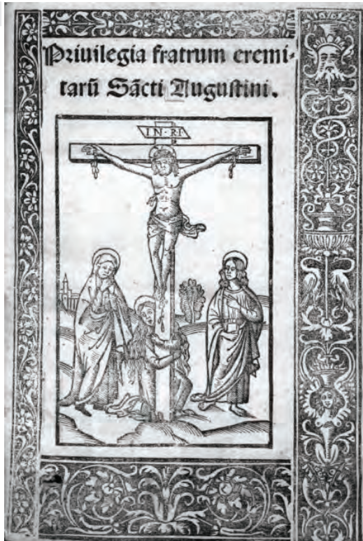
Privilegia fratrum eremitarum Sancti Augustini. - Pisauri: Per Hieronymo Soncino, 1515

This year our library has been invited to take part in the EUROPEANA project. The most unique old printed books were chosen to join the collection of cultural rarities at Europeana.eu. We also intend to continue our co-operation with the project in order to expand our participation in the future.