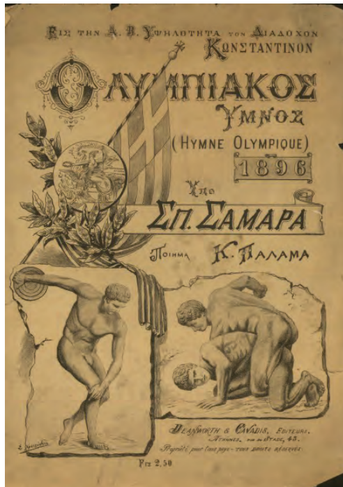
Spyridon Samaras, Hymne Olympique , Athens: Deanworth & Cavadis, 1896.

music. The archives of Greek composers and artists and the Rare Collections Department constitute a particularly significant part of this collection. Since 2000 several collections of the Greek Music Archive have been digitised and are now offered online through the following portals.