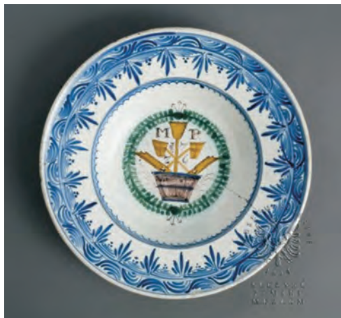
Moravian dish, 1726 Silesian Museum