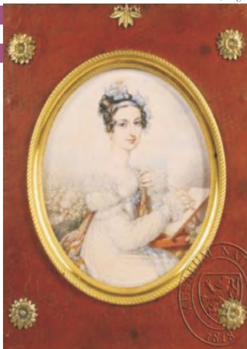
Anna Karolína Toskánská. Watercolor by Johann Nep. Ender, 1821 31,2x27,4 cm National Museum, Prague