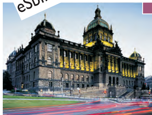
National Museum, Prague

In early November 2010 the National Museum, the largest museum institution in the Czech Republic, made public an online application www.esbirky.cz (meaning "electronic collections"), which aims to present collections of various Czech cultural heritage institutions online. It is the first portal in the Czech Republic that allows viewing of digitized collections of several institutions in one virtual place, which can be accessed without any limitations of time, money or geographical distance. Visitors only require Internet access. The development of the application took two years. It was originally intended only for presentation purposes at the National Museum, as part of its involvement in project ATHENA. It was also intended as a model project of integrating Czech culture institutions into the European digital library. The fact that the similar presentation appeared