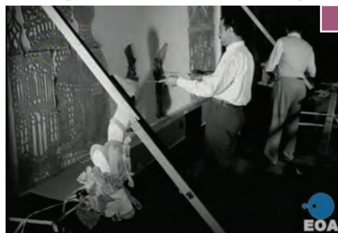
One of the most popular historical shows in Greece, illustrating the spirit of Greeks in the last few centuries, hard-working but also clever, always able to make the best of a difficult situation.