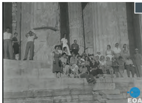
American teachers visiting the Acropolis in Athens (1953).

Hellenic culture has always played a key role in the development of tourism in Greece.