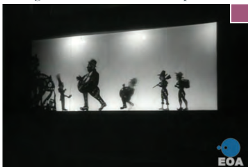
Evgenios Spatharis playing the Greek "Καραγκιόζης" in a galanty and puppet show in Rome (1961).

The Hellenic Ministry of Education, Lifelong Learning and Religious Affairs is developing plans to play the role of National Aggregator for content related to libraries and archives as well as of educational content. In this context, they are planning to offer access, through their Web site, to some 18.00.000 pages digitised in their public library network, and to about 5.000.000 pages of the Greek state archives. A small part, about 10% of these, is expected