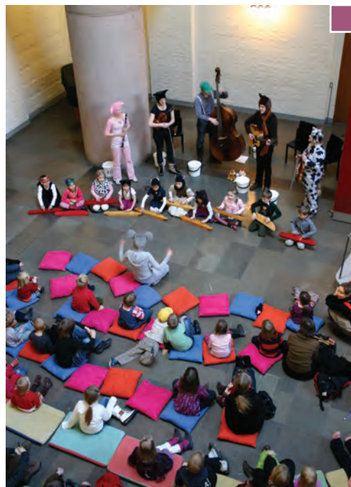
Children's music orchestra Ammu! arranged a very popular a Kalevala Day concert of traditional music at the National Museums of Finland.